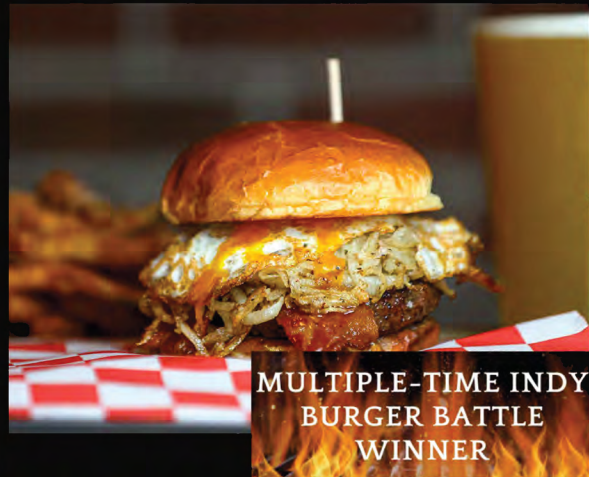
MULTIPLE-TIME INDY BURGER BATTLE WINNER